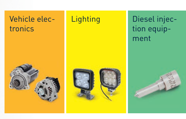
M A BRAND OF PE AUTOMOTIVE